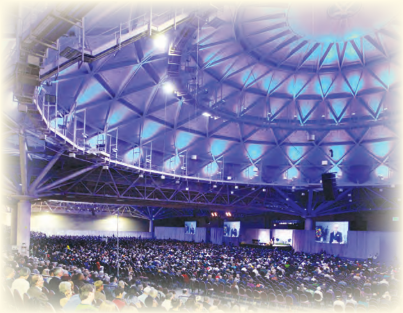
Thousands gather to celebrate the 50 th anniversary of ECKANKAR in October 2015.

The ECK message will reach people in ways that previous generations only dreamed of.