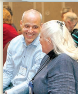
DIVE DEEP WITH ROUNDTABLE DISCUSSIONS AND SATSANG INTENSIVES *