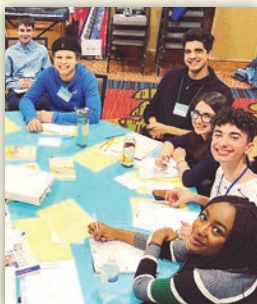
FUN YOUTH- AND-FAMILY PROGRAM