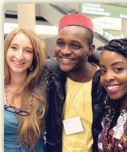
ECK NEW YEAR DANCE AND DESSERT SOCIAL