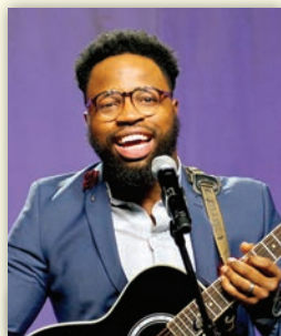
HEART-OPENING TALKS AND CREATIVE ARTS