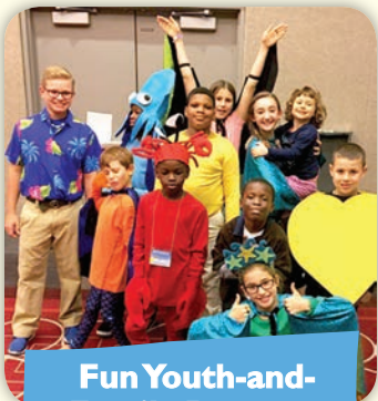
Fun Youth-and- Family Program