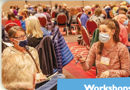
Workshops, Roundtable Discussions, Trainings, and Satsang Intensives *