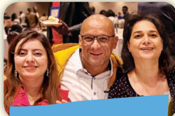
ECK New Year Dance and Dessert Social