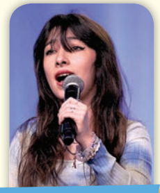
Heart-Opening Talks and Uplifting Creative Arts

*To preview handouts for the Satsang intensives, visit Eckankar.org > Members Area > Spiritual Services.