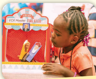
Engaging Youth-and-Family Program

Workshops, Roundtable Discussions, Satsang Intensives, and Meetings