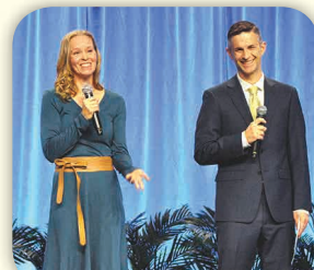
Heart-Opening Talks and Uplifting Creative Arts