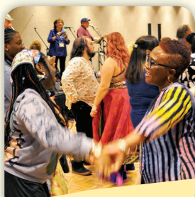
ECK Spiritual New Year Dance and Dessert Social